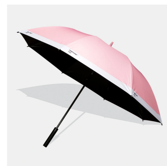
PANTONE LARGE UMBRELLA - PINK 182 $ 40.00