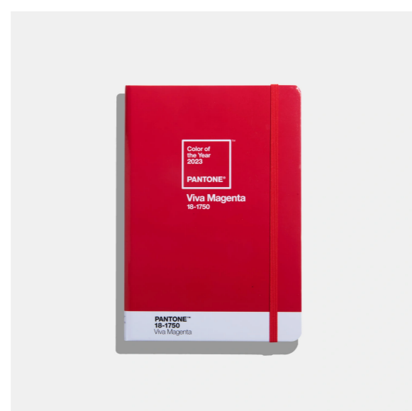
LIMITED EDITION NOTEBOOK, PANTONE COLOR OF THE YEAR 2023 $ 18.00