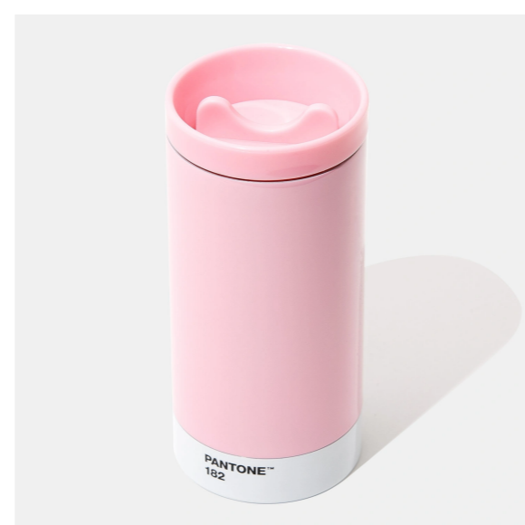
PANTONE TO GO CUP LIGHT PINK 182 $ 49.00